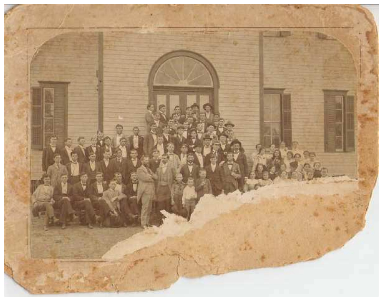
Figure 2 - Summer Hill Select School