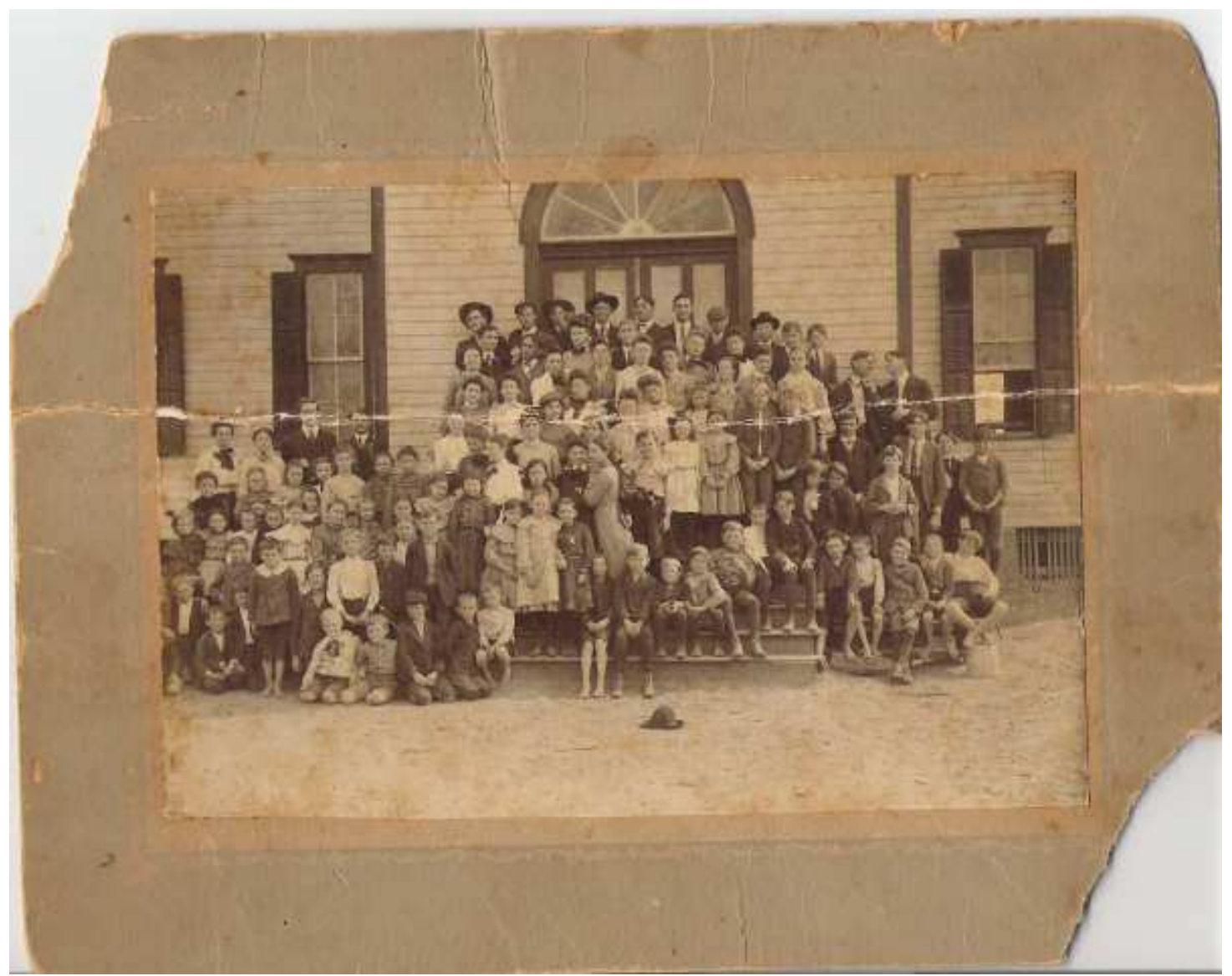
Figure 1 - Summer Hill Select School